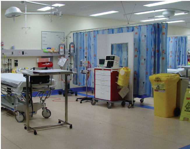
The major trauma resuscitation bay in the Emergency Department at Liverpool Hospital

Thelma Allen and all the nursing and medical staff in the ED, who were great.