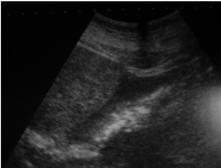
FAST scan in Resus